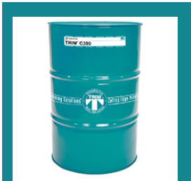
54-gallon drum SKU: C390/54 UPC-12: 641238075738