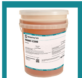
5-gallon pail SKU: C390/5 UPC-12: 641238075745