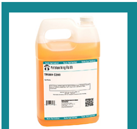
1-gallon jug SKU: C390/1 UPC-12: 641238075783