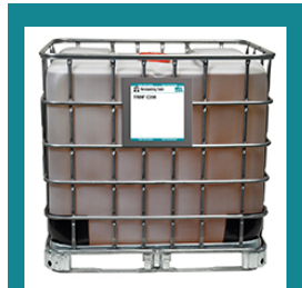
270-gallon tote SKU: C390/NR270P UPC-12: 641238075752

TRIM ® C390 | ©2019-2021 Master Fluid Solutions ® | 2021-12-27